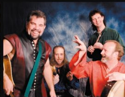
Bards of Celtic Rock-n-Roll